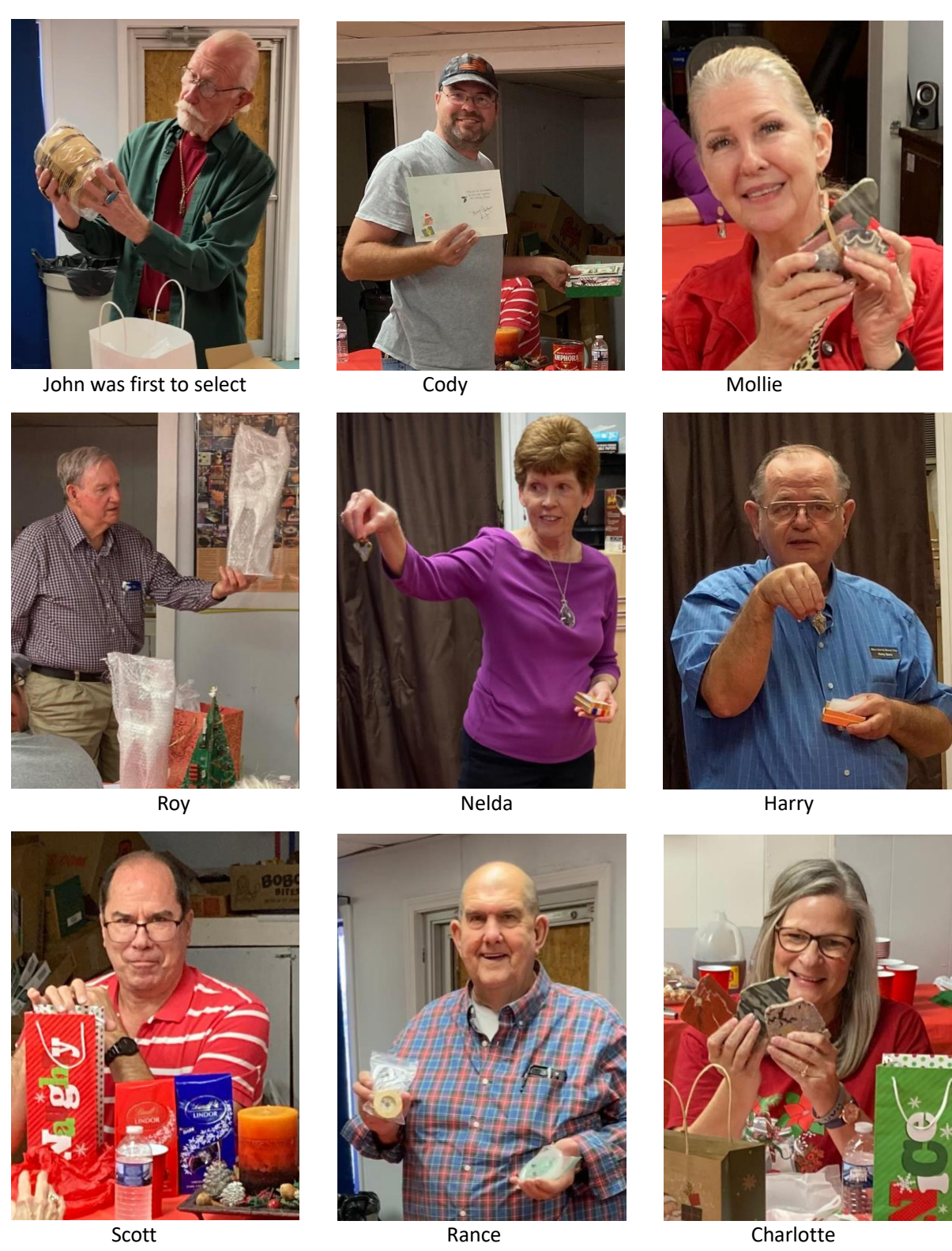
Gritty Greetings: Waco Gem and Mineral Club Newsletter