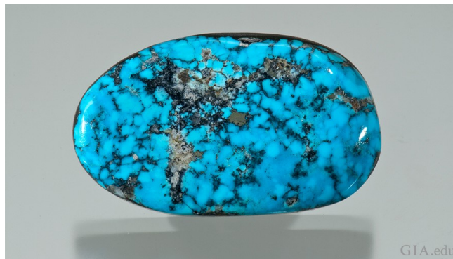
A 46.28 ct medium green blue turquoise free-form cabochon

This turquoise birthstone also played an important role in the lives of Native Americans. The Apache thought turquoise could be found by following a rainbow to its end. They also believed that attaching the December birthstone to a bow or firearm made one's aim more accurate. The Pueblo maintained that turquoise got its color from the sky, while the Hopi thought the gem was produced by lizards scurrying over the earth.