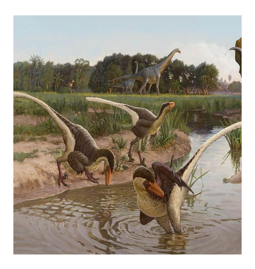
This, from The Smithsonian, via The Paleontological Society of Austin