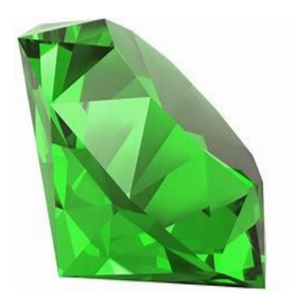
May birthstone: Emerald

Emerald's name is derived from the Greek word smaragdus, meaning "green gem."